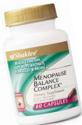
Menopause Balance Complex* 60 capsules #20645

A completely natural biological event, menopause is the time in a woman's life that signals the end of her childbearing years. Several years prior to menopause marks a time of transition — a time where a woman's ovaries begin to produce less of the reproductive hormones, estrogen, and progesterone.