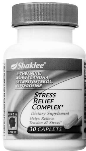
Stress Relief Complex 30 caplets #20656