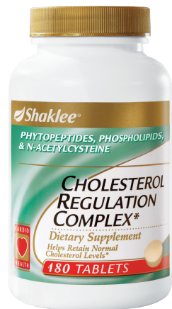
Cholesterol Regulation Complex* 180 tablets #20648